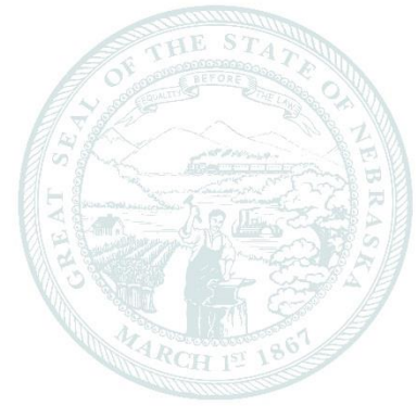
Pete Ricketts, Governor

State Headquarters 1500 Highway 2 PO Box 94759 Lincoln, NE 68509-4759 Communication Office: 402-479-4512 dot.nebraska.gov