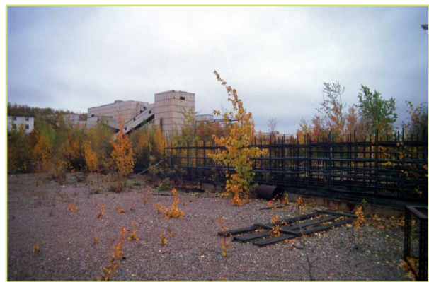
The Gunnar uranium mine in Saskatchewan.

Decommissioned uranium mines and decommissioned mill tailings in the Uranium City area of northern Saskatchewan are an ongoing source of contamination to Beaverlodge Lake and other nearby watersheds. Uranium and selenium levels are well above Saskatchewan Surface Water Quality Objectives. 25 The Gunnar uranium mine on the northern shore of Lake Athabasca is scheduled for remediation by the Saskatchewan Research Council. Originally a source of uranium for the nuclear weapons industry, remediation on the site is so complex to manage that estimated remediation costs have ballooned to over $200 million. 26