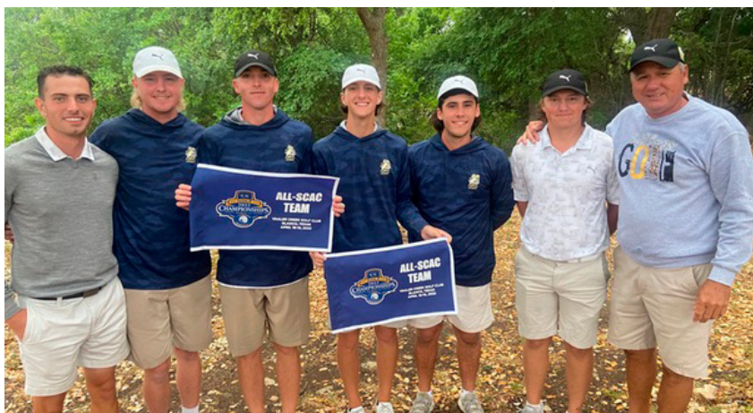
TLU men's golf team.

(Blanco) - Following 54 holes at the SCAC Championships, the Texas Lutheran men's golf team finished third at the SCAC Championships at the par-72 Vaaler Creek Golf Club.