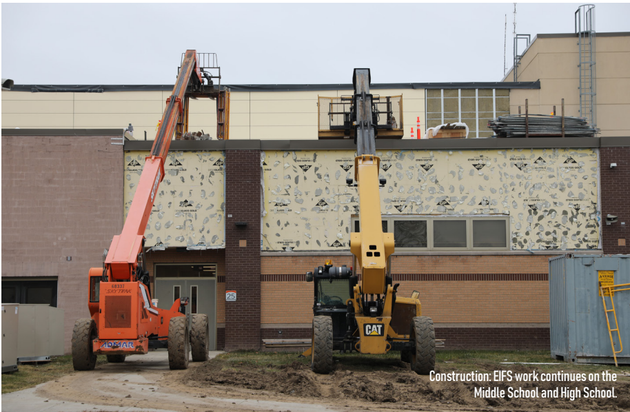
Construction: EIFS work continues on the Middle School and High School.