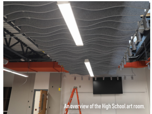
An overview of the High School art room.