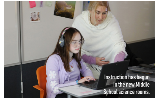
Instruction has begun in the new Middle School science rooms.